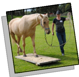
Photos from NHG 2011 Obstacle Trail

You will be judged on your partnership, your horse's willingness to attempt the obstacle and the successful completion of each task. There will be prizes for best at their points level and for best overall.